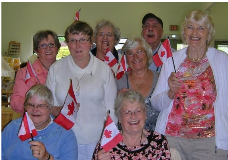
The Saanich Shuffle Boarders celebrate!

The main theme seems to be how lucky we are to live in this vast country so let's celebrate!