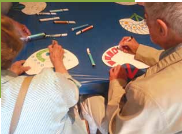
The Arts & Alzheimer's Program is coordinated by the We Rage We Weep Alzheimer Foundation and runs twice weekly at Silver Threads Centres.

We support community! During 2014-2015 we provided 892 hours of facility space to other non-profits for programs and services at no charge.