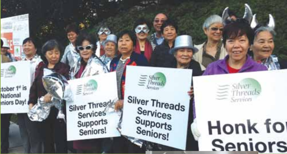
Silver Threads Service Chinese Seniors at the corner of Richmond and Bay Streets.