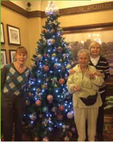
Silver Threads Crafters in front of their tree at the Fairmont Empress.