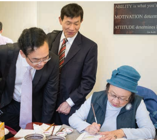
Delegates from Suzhou watch the technique of our Chinese brush painting class.