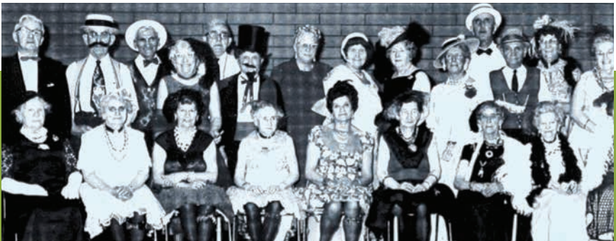
Silver Threads Members perform at the Saanich Centre 1969

Over the course of 60 years we have operated a variety of activity centres, Meals on Wheels and Outreach Programs in different parts of Greater Victoria, continually evolving to meet the needs of seniors. Over the past six decades some things have certainly changed but some have not – what hasn't changed is the need for seniors to feel connected, supported, and to stay active and healthy. That has always been what Silver Threads Service is all about. Thank you to everyone who has contributed to this great organization. Here's to the next 60!