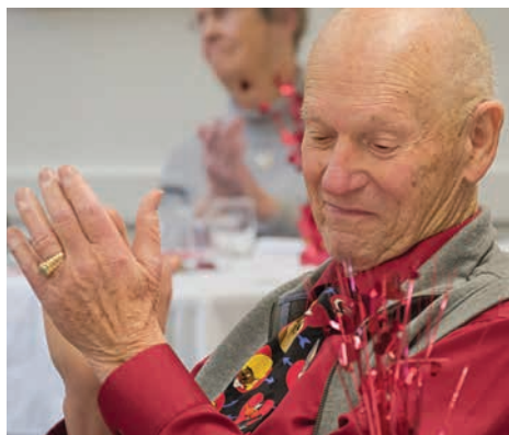
Enjoying the music at Valentine's Day

We are an inclusive service provider, serving members, non-member participants and