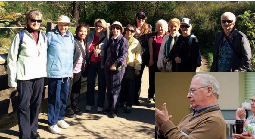
Right: Volunteers enjoy the music at the April Luncheon