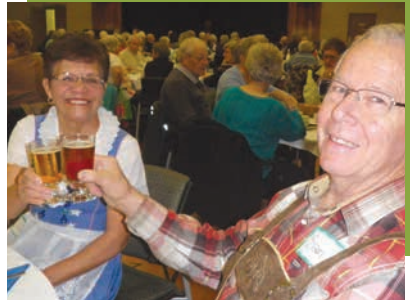
Member of the Victoria Accordion Club share a "bier and brot" toast to Oktoberfest. Prost!

Oktoberfest at the October Guess Who Coming to Dinner was a highlight of the twice monthly Saanich dinners. It might have been the beer (compliments of Vancouver Island Brewery) or the bratwurst that got the guests moving in a conga line around the room to the music of the Victoria Accordion Club!