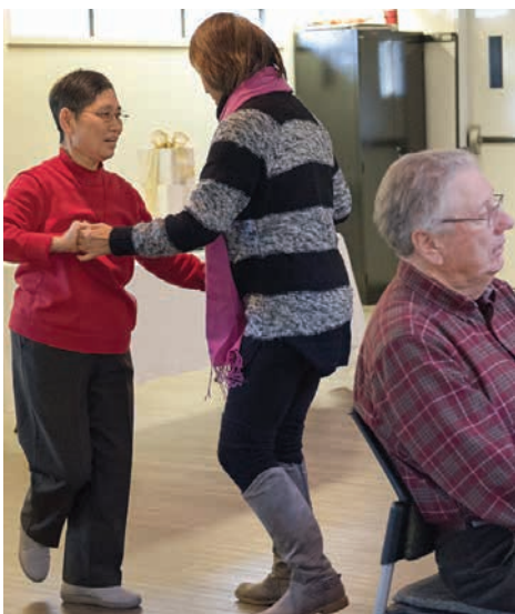
Moving to music