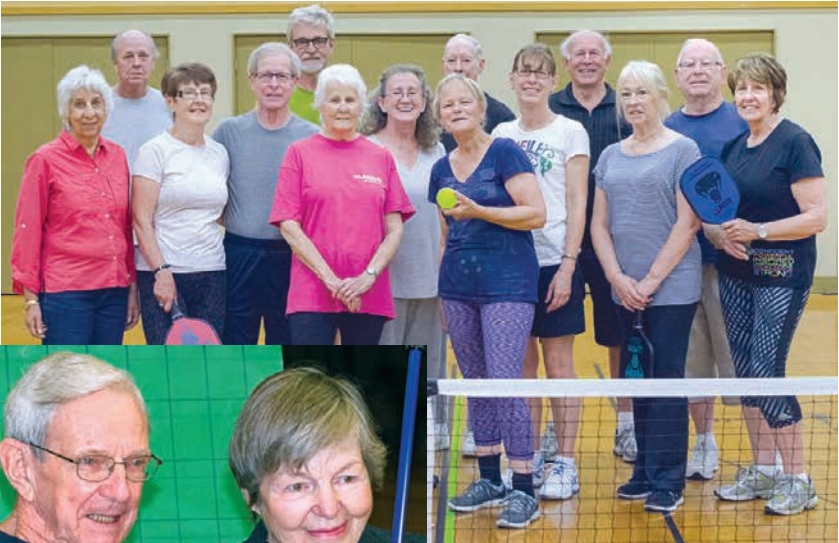
Above: Pickleball at the Saanich Centre