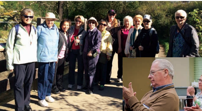
Right: Volunteers enjoy the music at the April Luncheon