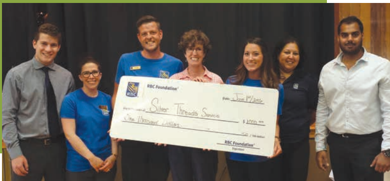
RBC Burnside Tillicum Branch Staff 3rd Annual Day of Service at the Saanich Centre.

Revera Retirement Living Royal Canadian Legion #127 Susan & Wayne Mew Foundation The R.K. Grant Family Foundation The Victoria Foundation: Anonymous Donor The Victoria Foundation: The Nellis Roy Moyer & Elizabeth Moyer Memorial Trust Tony and Mignon Fenton Trust Union of BC Municipalities United Way of Greater Victoria We Care Home Health Services