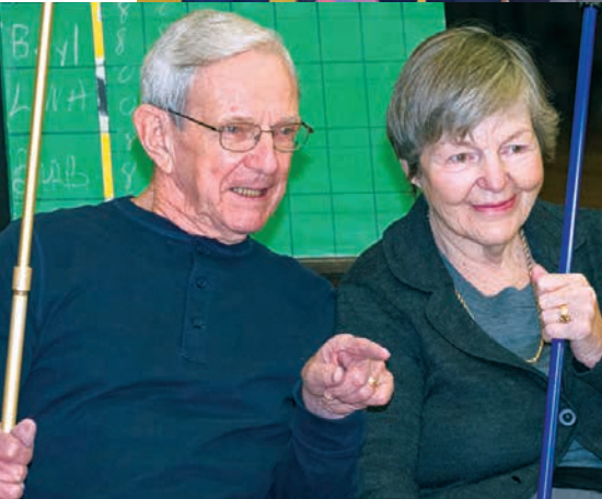
At left: Discussing strategy at Shuffleboard