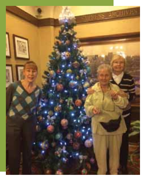
Silver Threads Crafters in front of their tree at the Fairmont Empress.