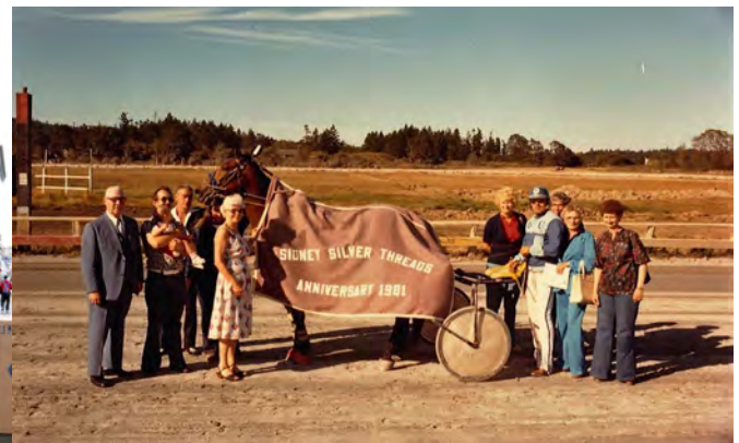
Celebrating in Sidney 1981