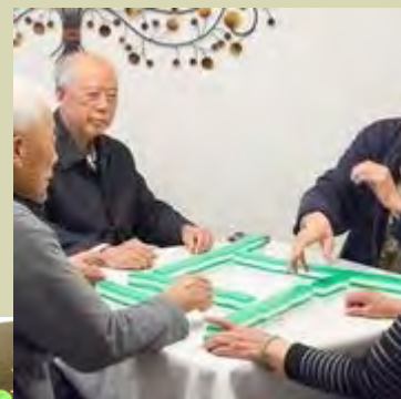
Mah Jong 2016