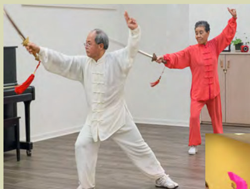
Chinese New Year 2016