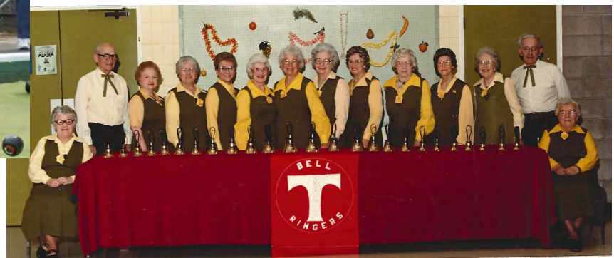
1983 - Silver Threads Bell Ringers

"(Silver Threads) can be justifiably proud of the reputation for excellence which you have earned by your diligence and hard work on behalf of others." ~ William N. Vander Zalm, (Past) Premier of British Columbia