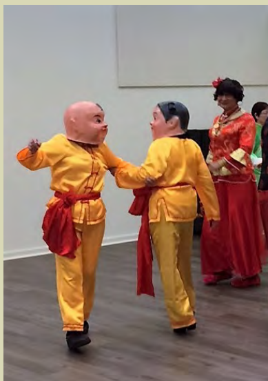
Chinese New Year 2015

The Chinese Seniors Association has been an integral part of Silver Threads Service since 2007 and provide weekly programs at the Victoria Centre that includes table tennis, Mah Jong and a Friendship Group. Each year Chinese New Year is a festive occasion thanks to their spectacular performances.