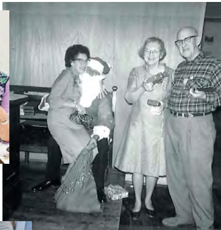
Sitting with Santa—past and present