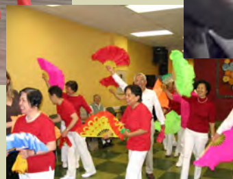
Dance Practice 2007