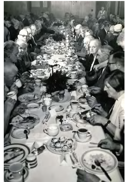
1968 Christmas Dinner

September 3rd 1965 was the Grand Opening of Silver Threads new Victoria Centre in Centennial Square, and in 1967 Silver Threads opened branches in Esquimalt, Sidney, and Saanich. The Saanich Center got its own home on Hampton Road in 1968 (which as you know remains the home of the Saanich centre today) and by 1986 the Saanich Centre saw more than 41,600 people pass through their doors and membership grew from 52 members to 857 members.