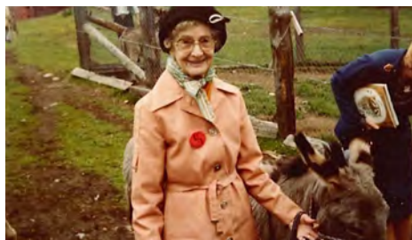
1980 Visit to the Rocky Point Donkey Farm in 1980