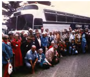
1980's Trip to Sea World