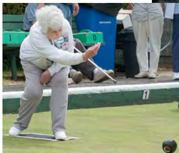
Memory PLUS June Party in 2016