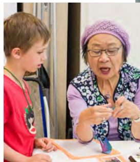
Intergenerational Art Show 2016