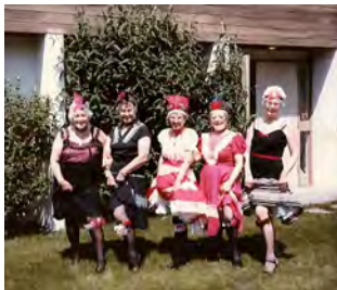
1986 Silver Threads' Can Can Girls