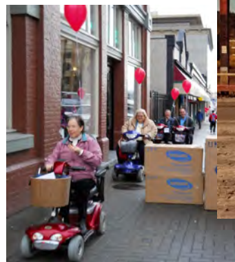
Scooter Racing 2010