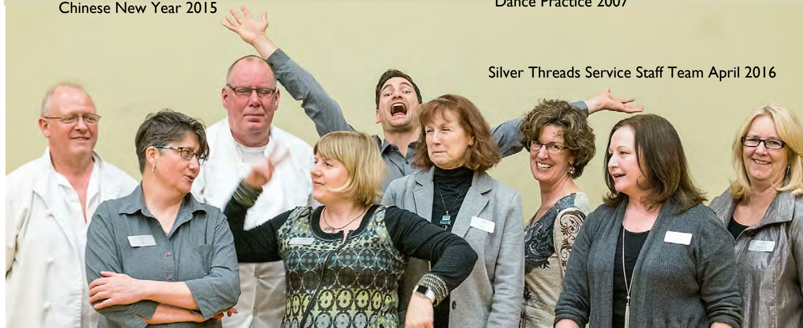
Silver Threads Service Staff Team April 2016