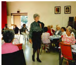
1989 Fashion Show