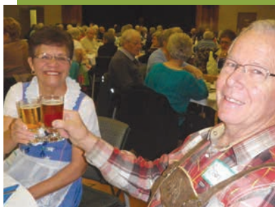
Member of the Victoria Accordion Club share a "bier and brot" toast to Oktoberfest. Prost!

Oktoberfest at the October Guess Who Coming to Dinner was a highlight of the twice monthly Saanich dinners. It might have been the beer (compliments of Vancouver Island Brewery) or the bratwurst that got the guests moving in a conga line around the room to the music of the Victoria Accordion Club!