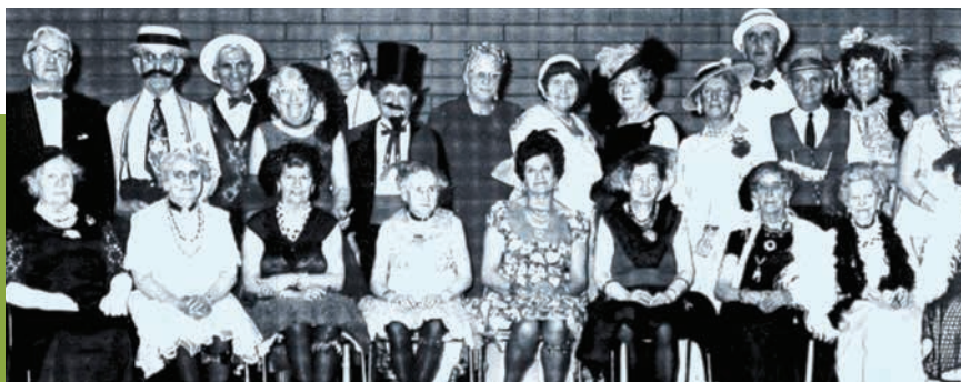
Silver Threads Members perform at the Saanich Centre 1969

Over the course of 60 years we have operated a variety of activity centres, Meals on Wheels and Outreach Programs in different parts of Greater Victoria, continually evolving to meet the needs of seniors. Over the past six decades some things have certainly changed but some have not – what hasn't changed is the need for seniors to feel connected, supported, and to stay active and healthy. That has always been what Silver Threads Service is all about. Thank you to everyone who has contributed to this great organization. Here's to the next 60!