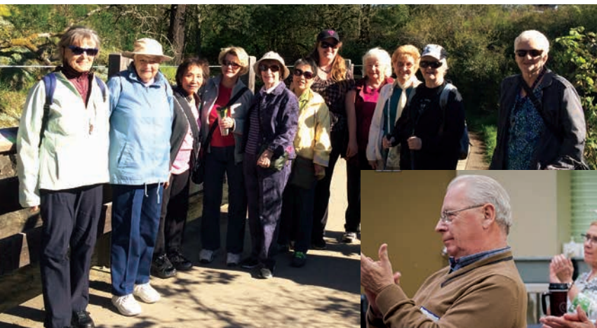
Right: Volunteers enjoy the music at the April Luncheon