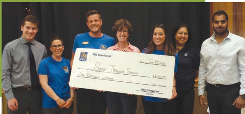
RBC Burnside Tillicum Branch Staff 3rd Annual Day of Service at the Saanich Centre.