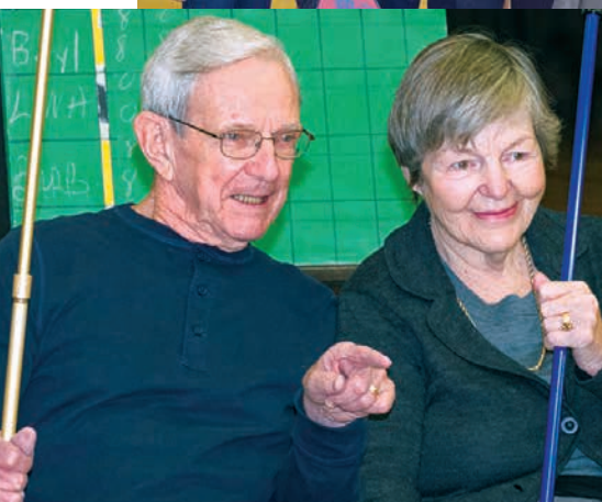
Above: Pickleball at the Saanich Centre