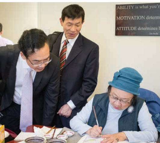
Delegates from Suzhou watch the technique of our Chinese brush painting class.