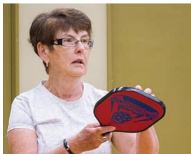
Pickleball continues to grow in popularity.

Senior Mentors are trained volunteers available to help seniors' complete forms and applications and sort through red tape, in the words of one client "pass on to my mentor that I have everything ALL tickety-boo. I now understand it all and have everything in order, thanks to her. This service you offer is absolutely amazing. THANKS, thanks, thanks."