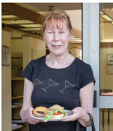
3rd Annual Summer Barbecue

Partnerships include the Arts & Alzheimer's group, for those impacted by the disease, and their family members, and the MS Society that provides weekly programs and assistance for clients in the centre.