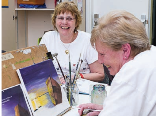
Sharing laughs at the MS Art Program