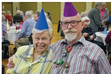
Our parties and members are the best!

Our special events featured celebrating Canada 150, hosting 20 Guess Who's Coming to Dinners, and 15 different Holiday events, including the popular New Years Party.