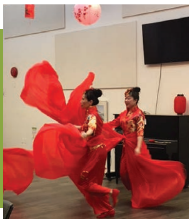
Celebrating the Year of the Dog