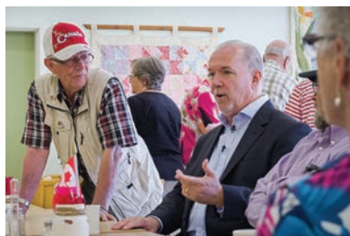
In June we welcomed John Horgan to the Saanich Centre.