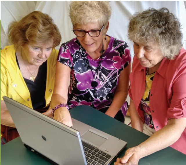
Members of VCC enjoy learning together.

Thank you Victoria Computer Club for an excellent first year. You are an asset to our organization!