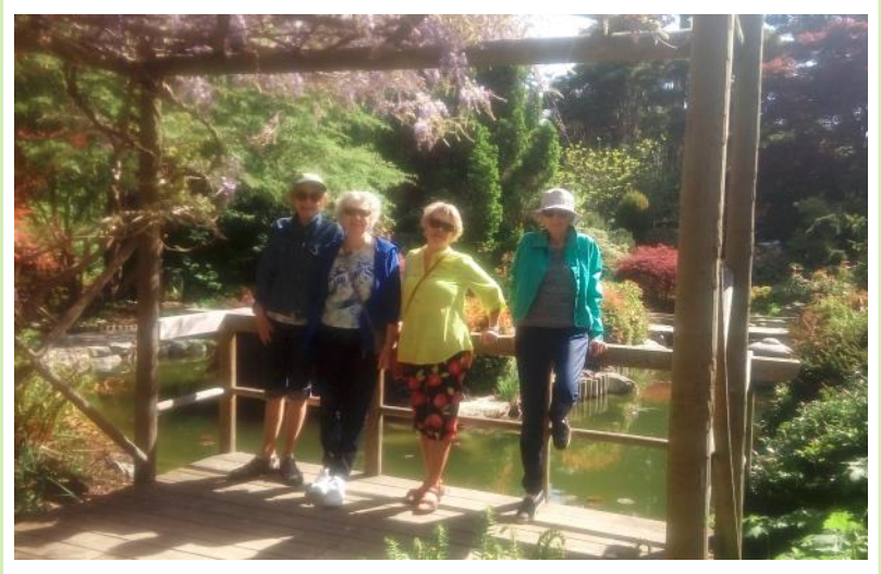
Cost: No charge Watch for the Walking Group at the

Date: Every Wednesday all year round Time: 10:00am to 11:00am