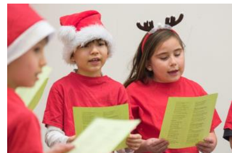
Christmas Performance by the students of Selkirk Montessori

A special Christmas Concert featuring children from Selkirk Montessori School and a performance by South Island Harmonies made for a lively afternoon of spirited songs which was enjoyed by all.