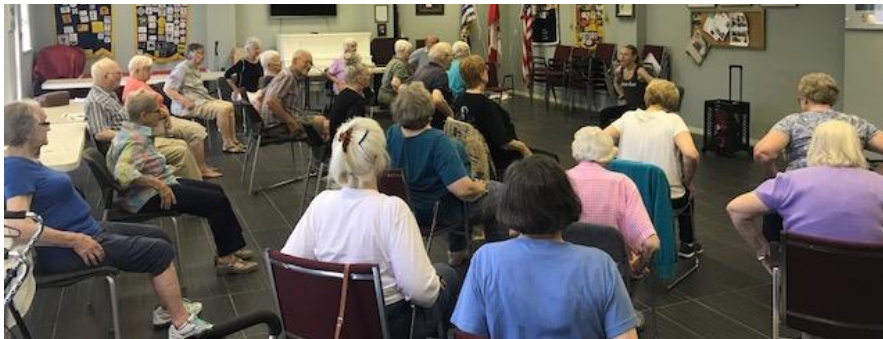
Weekly exercise program at Kiwanis Housing

The Lunch and Learn Series tackled some serious discussion including the topic of Advance Care Planning. With over 60 people engaged, repeat sessions were provided and showed the importance of open communication and the need for information in planning for end of life.